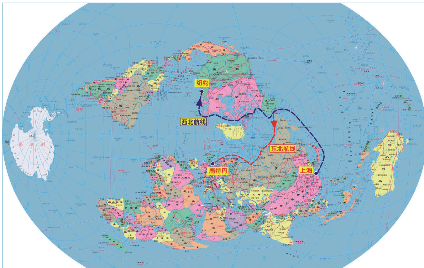
Figure 2. A Chinese view of Arctic sea routes

The captions label Shanghai, Rotterdam, New York, the 'North East Sea Route' (red) and the 'North West Sea Route' (blue).