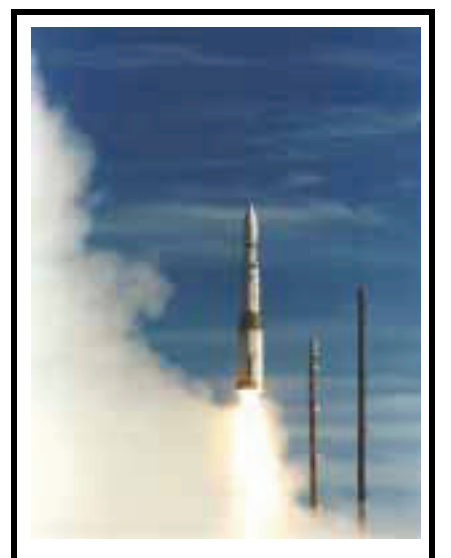
Launch of Exo-atmospheric Kill Vehicle (EKV) on prototype missile interceptor as part of US NMD Integrated Flight Test programme, July 2000

Concerns about the readiness and reliability of the NMD system technology have been underscored by the failures suffered in the BMDO's Integrated Flight Test Programme. Five flight tests have been conducted to date. Three of these (in Oct. 1999, Jan. 2000 and July 2001) have been interception tests using a prototype kill vehicle. A simulated target warhead was destroyed in the first test, although critics