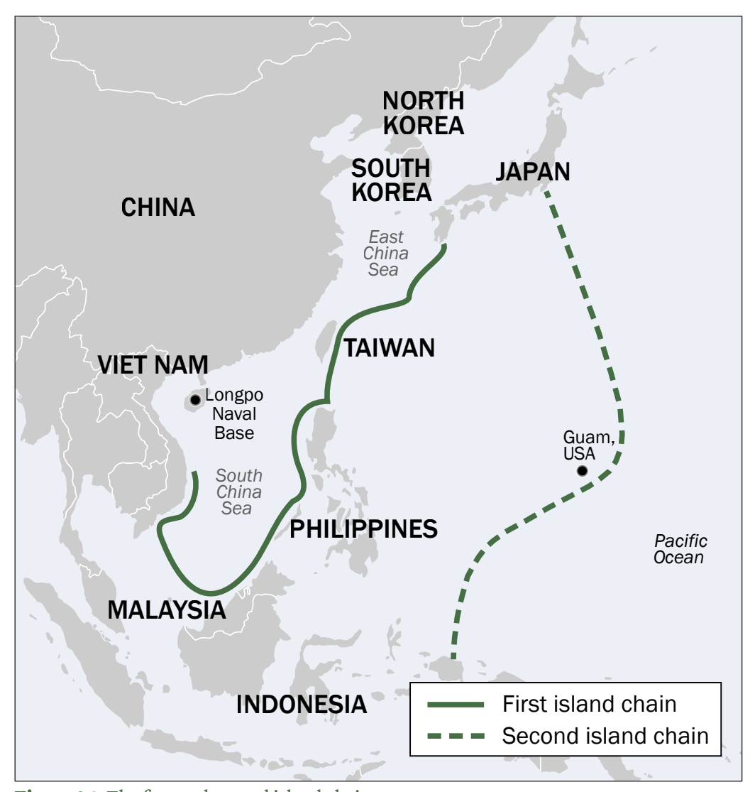
Figure 2.1. The first and second island chains

reconnaissance (ISR) activities of US allies near Chinese waters—including their joint underwater awareness operations.<sup>33</sup> China's long-term objective to overcome these obstacles is underscored by its anticipated introduction of the Type 096 SSBN (explored further in chapter 3), which will allow it to conduct patrols in the high seas. China's enhanced surface combat capability may also partly facilitate submarine deployment beyond coastal waters.<sup>34</sup> Indeed, it is conducting military exercises incorporating submarines and ASW operations in the high seas with increasing frequency.<sup>35</sup>