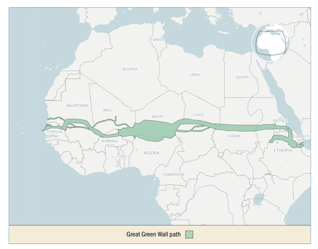
Figure 4.4. Map of the Great Green Wall

GGW = Great Green Wall; BRICKS = Building Resilience Through Innovation, Communication and Knowledge Services; FLEUVE = Front Local Environnemental pour une Union VertE (Local Environmental Coalition for a Green Union).