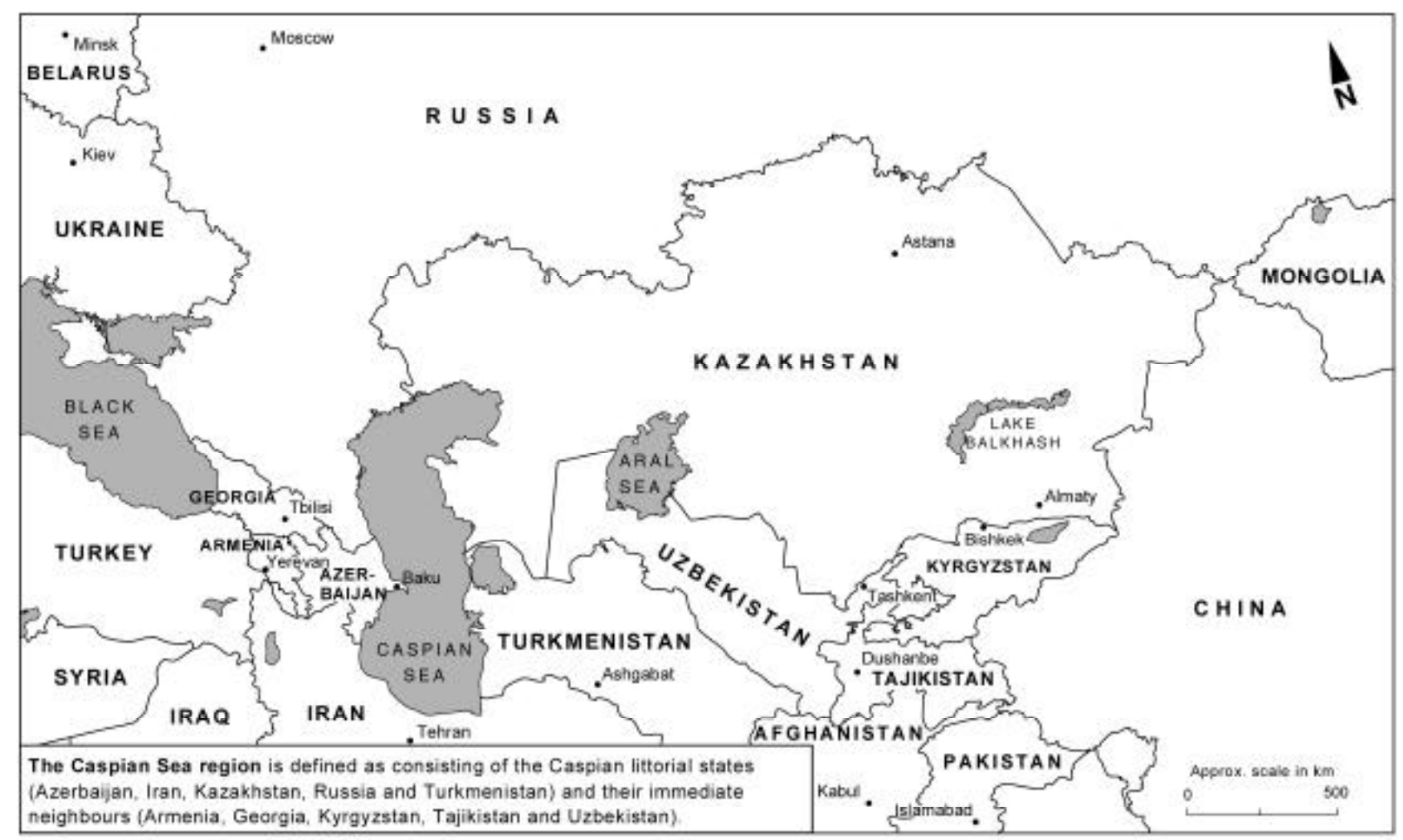
Figure 1.1. Map of the Caspian Sea region